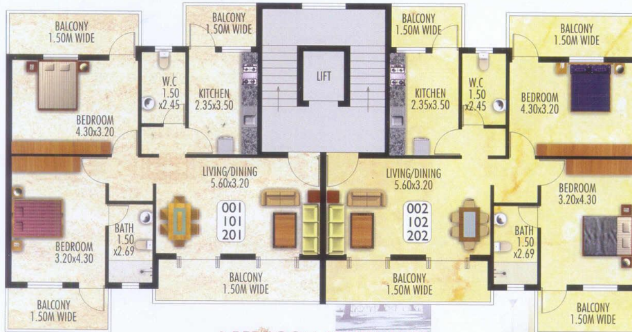
2 BEDROOM APARTMENTS